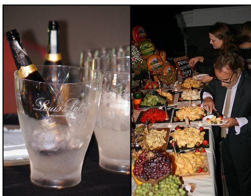
Above: Images from last year's Wine & Bubbles Night hosted by The Triangle.

Our Mission: ISC educates students from diverse cultures to have the skills to think creatively, communicate effectively, reason critically, and act compassionately.