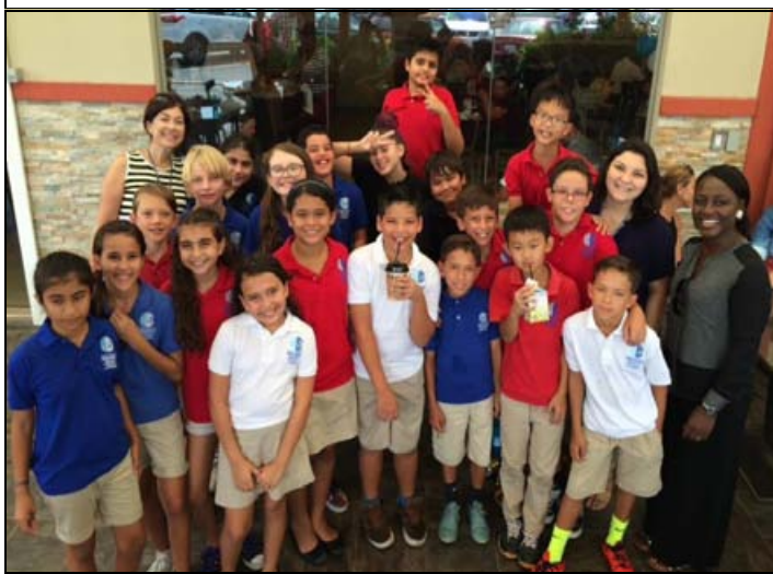
Above: Grade 5 students at the Chit Chat Café met to read poetry to their parents.

We celebrated their finished pieces by going to the Chit Chat Café and having students invite their parents and other family members to this event. The student poets read aloud some of the poems they wrote and enjoyed a fantastic breakfast afterwards.