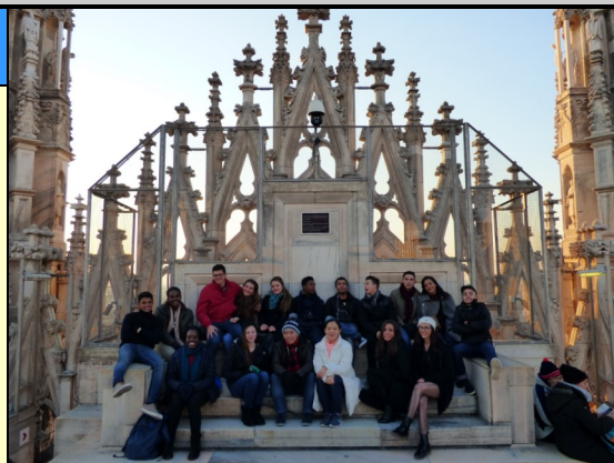
Above: ISC'S 2016 THIMUN Delegation pose on the roof of the Duomo in Milan, Italy.